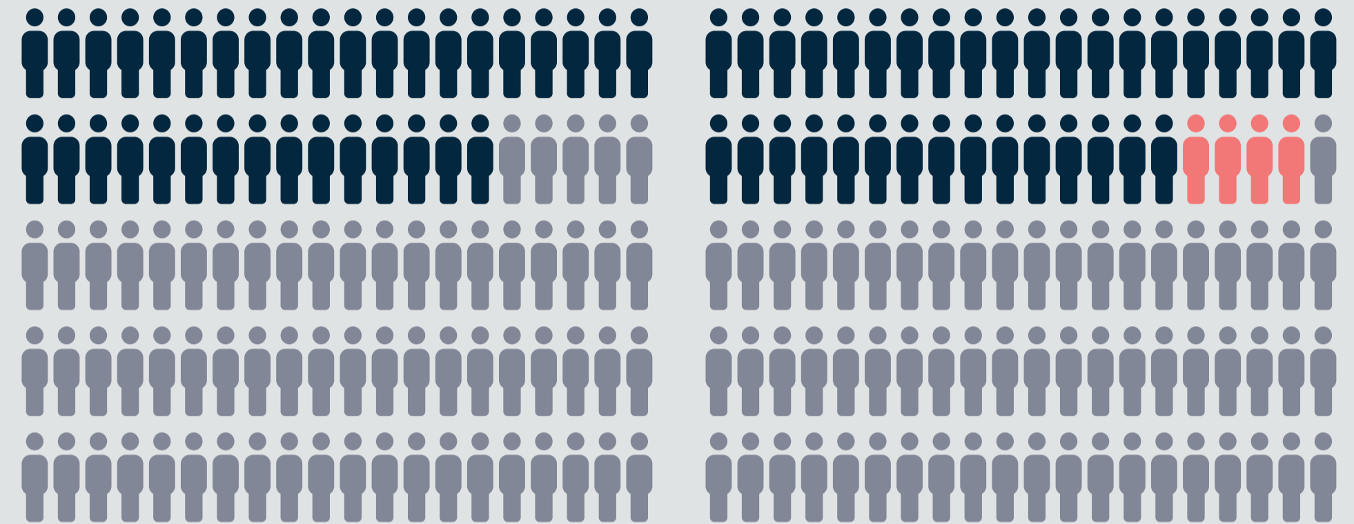
Proportion of disadvantaged pupils who are persistently disadvantaged in 2017

There are more students in long term poverty